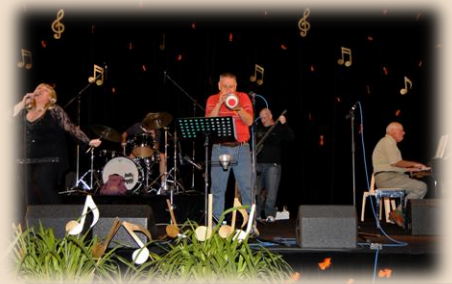
Quintet performing at the Hub

GOOD LIFE (THE) GOODNIGHT IRENE GOODNIGHT SWEETHEART GREEN GUESS I'LL HANG MY TEARS OUT TO DRY GYPSY IN MY SOUL (THE) HALLELUJAH HALLELUJAH I LOVE HIM SO HAVE YOURSELF A MERRY LITTLE CHRISTMAS HELLO DOLLY HERE'S LOOKING AT YOU HE'S MY GUY HEY JOHN HIT THAT JIVE JACK HIT THE ROAD TO DREAMLAND HONEY PIE HONEYSUCKLE ROSE HOW ABOUT ME HOW DEEP IS THE OCEAN HOW HIGH THE MOON HOW INSENSITIVE HOW LONG HAS THIS BEEN GOING ON HUNDRED YEARS FROM TODAY, A I CAN SEE CLEARLY NOW I CAN'T GET STARTED I CAN'T GIVE YOU ANYTHING BUT LOVE I CONCENTRATE ON YOU I COULD BE SO GOOD FOR YOU I COULD WRITE A BOOK I COVER THE WATERFRONT I DEDICATE THIS TO YOU I DIDN'T KNOW ABOUT YOU I DIDN'T KNOW WHAT TIME IT WAS I DON'T KNOW ENOUGH ABOUT YOU I DON'T KNOW WHY I DON'T STAND A GHOST OF A CHANCE WITH YOU I DOUBLE DARE YOU I FALL IN LOVE TOO EASILY I GET A KICK OUT OF YOU I GOT RHYTHM I HAD THE CRAZIEST DREAM I HAVE DREAMED I HEAR MUSIC I LET A SONG GO OUT OF MY HEART I MAY BE WRONG I ONLY HAVE EYES FOR YOU I REMEMBER CLIFFORD I REMEMBER YOU I SHOULD CARE