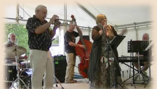
Quintet at the Grampians' Jazz Festival

NATURE BOY NEARNESS OF YOU NEVER LET ME GO NEVERTHELESS NEW YORK STATE OF MIND NICE WORK IF YOU CAN GET IT NIGHT AND DAY NIGHTINGALE SANG IN BERKELEY SQUARE (A) NIGHTMOVES NO MORE BLUES NO SOAP, NO HOPE BLUES OLD DEVIL MOON ON A CLEAR DAY ON GREEN DOLPHIN STREET ON REVIVAL DAY ON THE STREET WHERE YOU LIVE ON THE SUNNY SIDE OF THE STREET ONCE IN A WHILE ONE FOR MY BABY ONE MORNING IN MAY ONE NOTE SAMBA ONLY TRUST YOUR HEART OUR DAY WILL COME OUR LOVE IS HERE TO STAY OUT OF NOWHERE OVER THE RAINBOW PEEL ME A GRAPE PENNIES FROM HEAVEN PEOPLE WILL SAY WE'RE IN LOVE PERDIDO PERHAPS PERHAPS PERHAPS PICK YOURSELF UP PLAY IT AGAIN SAM PLEASE DON'T TALK ABOUT ME WHEN I'M GONE PMS BLUES POPSICLE TOES PRELUDE TO A KISS PURE IMAGINATION PUT YOUR HAND IN THE HAND RAINBOW CONNECTION, THE REFLECTIONS (LOOKING BACK) REMINISCING RIO DE JANIERO BLUE ROCKIN' CHAIR ROUND MIDNIGHT ROUTE 66 ROXANNE RUBBER DUCKIE RUBY MY DEAR