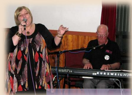
Duo at Inverloch

SUNDAY SUNDAY KIND OF LOVE, A SUNNY SURREY WITH THE FRINGE ON TOP SWAY SWEET GEORGIA BROWN SWEET GEORGIE FAME SWING LOW, SWEET CHARIOT S'WONDERFUL TAKE FIVE TAKE LOVE EASY TAKE THE A TRAIN TAKING A CHANCE ON LOVE TEA FOR TWO TEACH ME TONIGHT TENDERLY THAT OLD BLACK MAGIC THAT OLD FEELING THAT'S ALL THAT'S AMORE THAT'S FOR ME THEM THERE EYES THERE IS NO GREATER LOVE THERE WILL NEVER BE ANOTHER YOU THERE'LL BE SOME CHANGES MADE THERE'S A LULL IN MY LIFE THERE'S A SMALL HOTEL THERE'S NO YOU THEY ALL LAUGHED THEY CAN'T TAKE THAT AWAY FROM ME THEY SAY IT'S SPRING THEY SAY IT'S WONDERFUL THINGS WE DID LAST SUMMER (THE) THIS CAN'T BE LOVE THIS COULD BE THE START OF SOMETHING BIG THIS HEART OF MINE THIS MASQUERADE THOU SWELL THREE COINS IN THE FOUNTAIN THREE LITTLE WORDS TILL THERE WAS YOU TIME AFTER TIME TODAY I LOVE EVERYBODY TOO CLOSE FOR COMFORT TOO LATE NOW TOO MARVELOUS FOR WORDS TOP OF THE WORLD TOUCH OF YOUR LIPS (THE) TRAVELIN' LIGHT