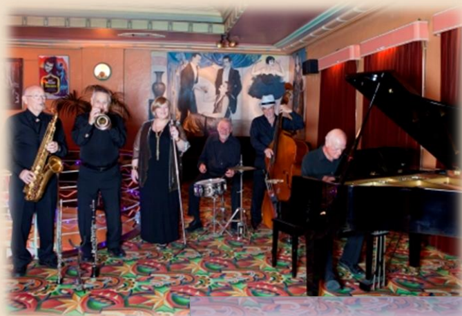
Septet at the Astor Theatre

Booking the band for a function? We highly recommend selecting all your favourite tunes from our repertoire and we will build your night's entertainment around those numbers.