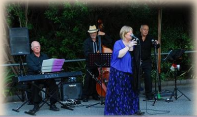
Quartet: Wilson Botanic Park

I THOUGHT ABOUT YOU I WALK A LITTLE FASTER I WANT TO BE A SIDEMAN I WAS DOIN' ALL RIGHT I WISH I KNEW I WISH I WERE IN LOVE AGAIN I WISH I'D MET YOU I WON'T DANCE IF DREAMS COME TRUE IF I DIDN'T HAVE YOU IF I ONLY HAD A BRAIN IF I WERE A BELL I'LL BE AROUND I'LL STRING ALONG WITH YOU I'LL TAKE ROMANCE I'LL WALK ALONE ILL WIND I'M AFRAID THE MASQUERADE IS OVER I'M BEGINNING TO SEE THE LIGHT I'M CHECKING OUT I'M COMIN' VIRGINIA I'M GLAD THERE IS YOU I'M JUST A LUCKY SO-AND-SO I'M NOT IN LOVE I'M OLD FASHIONED I'M PUTTING ALL MY EGGS IN ONE BASKET I'M SHADOWING YOU IMAGINATION IN A MELLOW TONE IN A SENTIMENTAL MOOD IN LOVE IN VAIN IN THE EYE OF THE STORM IN THE STILL OF THE NIGHT IN THE WEE SMALL HOURS OF THE MORNING IN WALKED BUD INSIDE A SILENT TEAR INVITATION ISN'T IT A PITY ISN'T THAT THE THING TO DO ISN'T THIS A LOVELY DAY IT COULD HAPPEN TO YOU IT DON'T MEAN A THING... IT HAD TO BE YOU IT NEVER ENTERED MY MIND IT'S ALRIGHT WITH ME IT'S EASY TO REMEMBER IT'S LOVE IT'S MAGIC IT'S ONLY A PAPER MOON