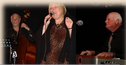
Trio at the Peninsula Lounge