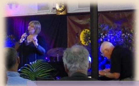
Duo performance, 2012

BLESS YOU SISTER BLOSSOM FELL, A BLUE MONK BLUE MOON BLUE ROOM BLUE SKIES BODY AND SOUL BORN TO BE BLUE BROTHER CAN YOU SPARE A DIME BUT BEAUTIFUL BUT NOT FOR ME BYE BYE BLACKBIRD CAN'T HELP LOVIN' THAT MAN CARAVAN CARELESSLY CHANGE PARTNERS CHEEK TO CHEEK CHILD IS BORN, A CHRISTMAS SONG, THE CLOSE YOUR EYES COME RAIN OR COME SHINE COME SUNDAY COMES LOVE CORCOVADO CRAZY CRAZY HE CALLS ME CRAZY RHYTHM CRY ME A RIVER DANCE ME TO THE END OF LOVE DANCING IN THE DARK DANCING ON THE CEILING DARN THAT DREAM DAY BY DAY DAY DREAM DAYS OF WINE AND ROSES DEED I DO DEVIL MAY CARE DO I LOVE YOU DO IT AGAIN DO IT THE HARD WAY DO IT TO ME ONE MORE TIME DO NOTHING 'TILL YOU HEAR FROM ME DON'T BE THAT WAY DON'T EXPLAIN DON'T GET AROUND MUCH ANY MORE DON'T WORRY 'BOUT ME DOODLIN' DOWN BY THE RIVER'S SIDE DOWN IN BRAZIL